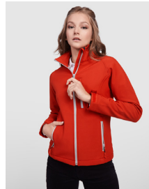
ANTARTIDA WOMAN R6433