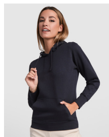
URBAN WOMAN R1068